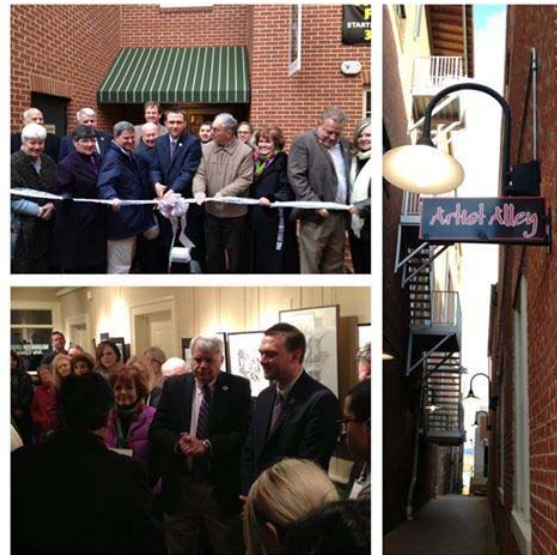
Grand Opening & Ribbon Cutting